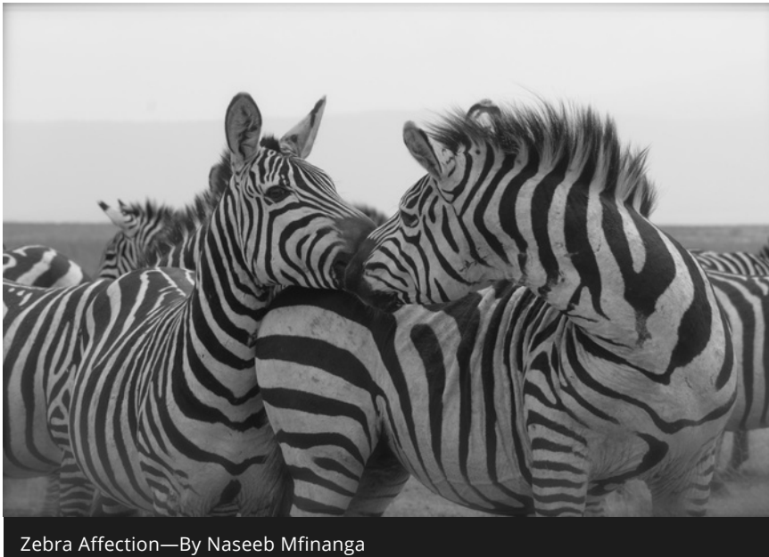
Zebra Affection—By Naseeb Mfinanga